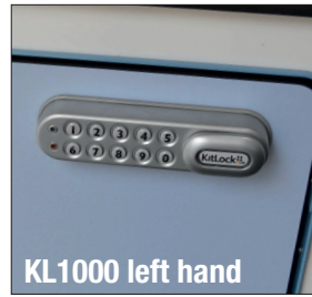
KL1000 left hand