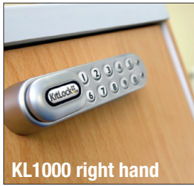
KL1000 right hand