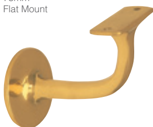
5153 75mm Flat Mount