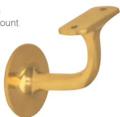
5140 60mm Flat Mount