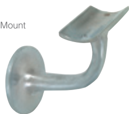
5166 60mm Curved Mount