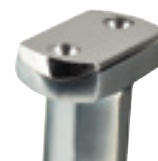
Showing flat mount adaptor