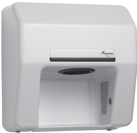
BA101 - White

The Supreme BA101 hand dryer is a heavy duty and economical model. With over 20 years proven reliability in New Zealand environments, the machine's unique drying chamber and air recirculating feature reduce drying time. Suitable for installation over bench tops or reflective surfaces.